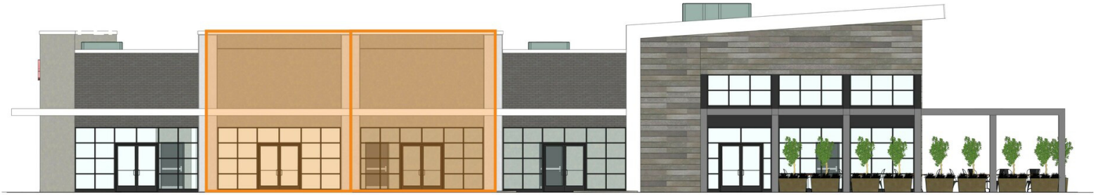
Front Elevation Scale: 1/4" = 1'-0"

FOR LEASE INLINE SPACES 1,200 SF | 1,530